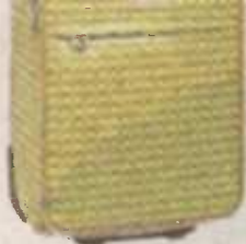
Green car print £159, Tripp at Debenhams, 08445 616161