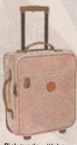
Pink suede with brown trim £225, Bric's at Harrods, 020 7730 1234