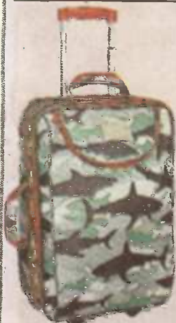
Shark print £49, Mini Boden, www.boden.co.uk