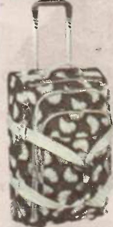
Daisy print £117, Kipling, 020 7287 1985