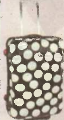
Black and white spots £30, Matalan, 0845 330 3330