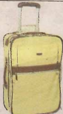
Yellow with brown trim £475, Tumi, 020 7493 4138