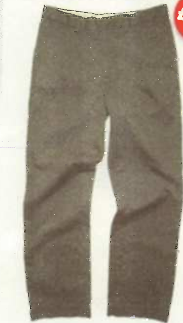
MYBESTBUY 'Perfect with a white t-shirt and plimsolls' Gap slimfit trousers £39.50, 0800 427 789