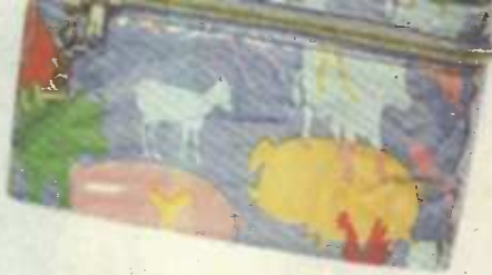
Farm animal print £24, Plain Jane at Urban Outfitters , www.urbanoutfitters.co.uk