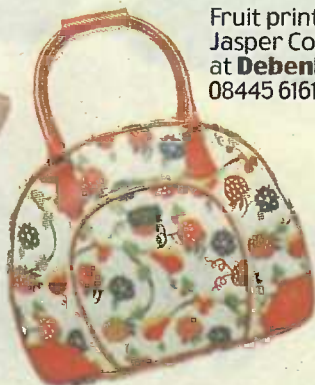
Fruit print £65, Jasper Conran at Debenhams , 08445 616161