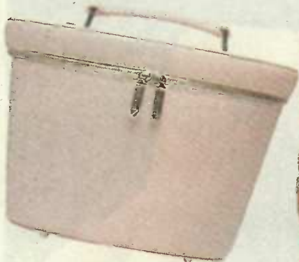
Pale pink leather £295, Aspinal of London , www.aspinaloflondon.com