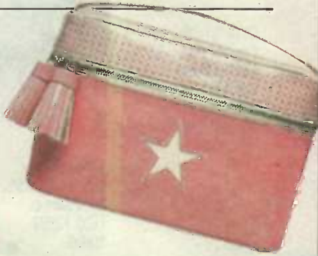
Pink with cream star £15, Soap & Glory at Boots , 0845 0708 090