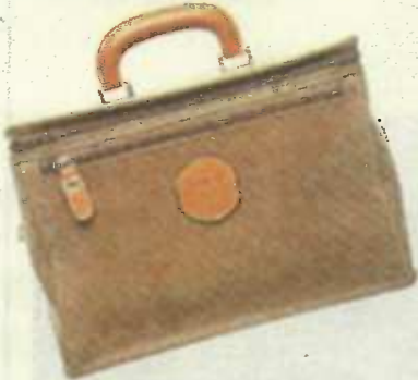
Brown suede £130, Bric's at Harrods , 020 7730 1234