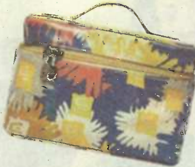
Blue with floral print £50, Lulu Guinness , 020 7823 4828