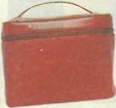
Red leather £80, Penhaligon's , 0800 716 108